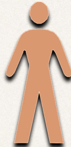
V. 7 (Nude)