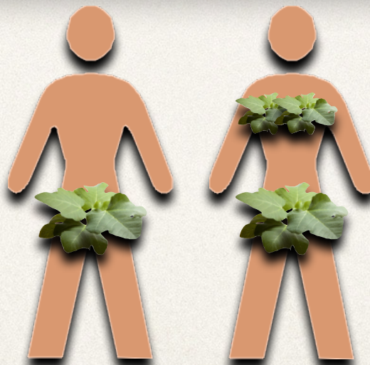
V. 10,11,21 Not Sufficiently Clothed