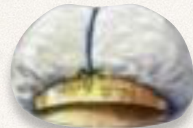
Plate of Pure Gold