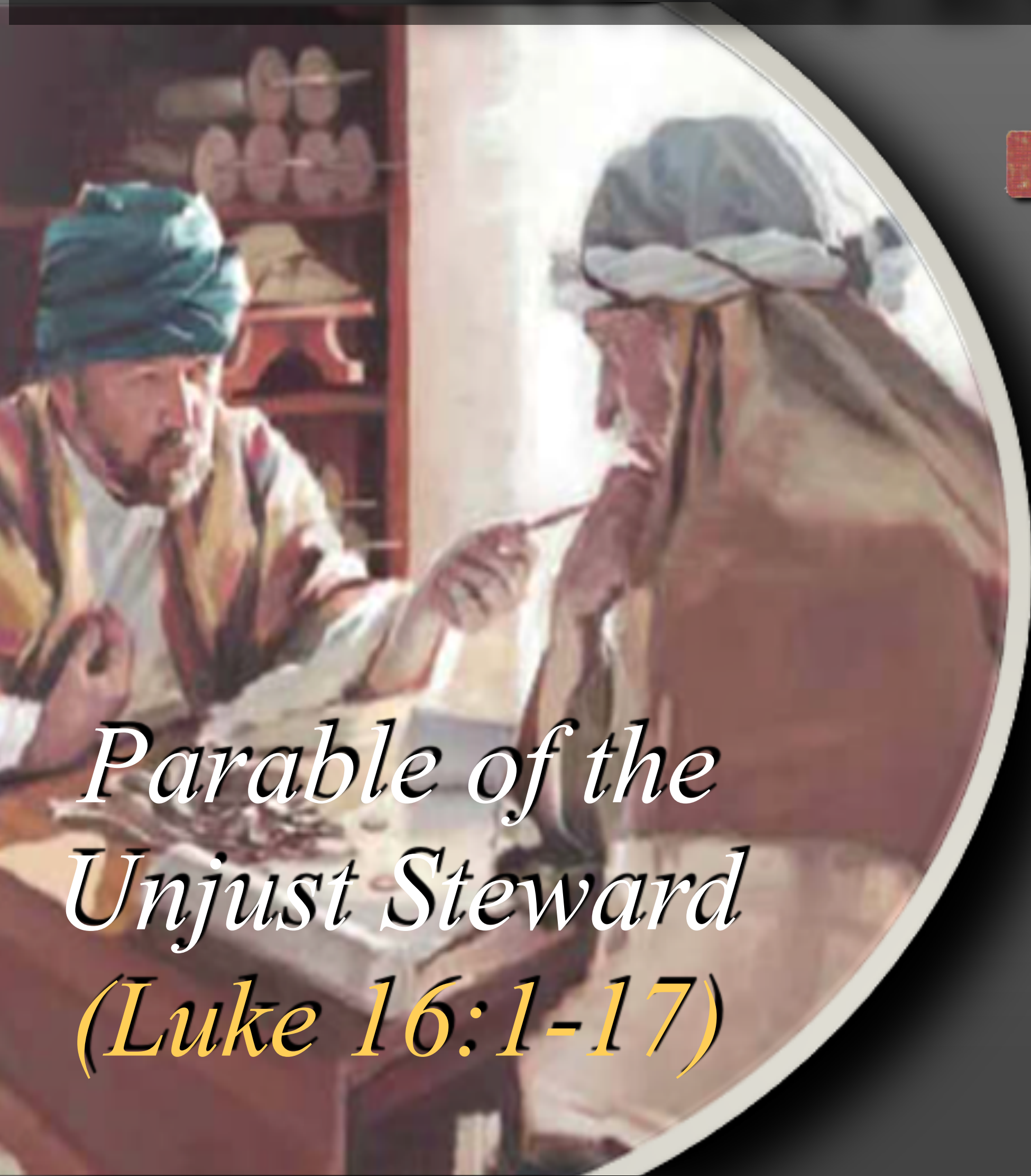
Parable of the Unjust Steward (Luke 16:1-17)