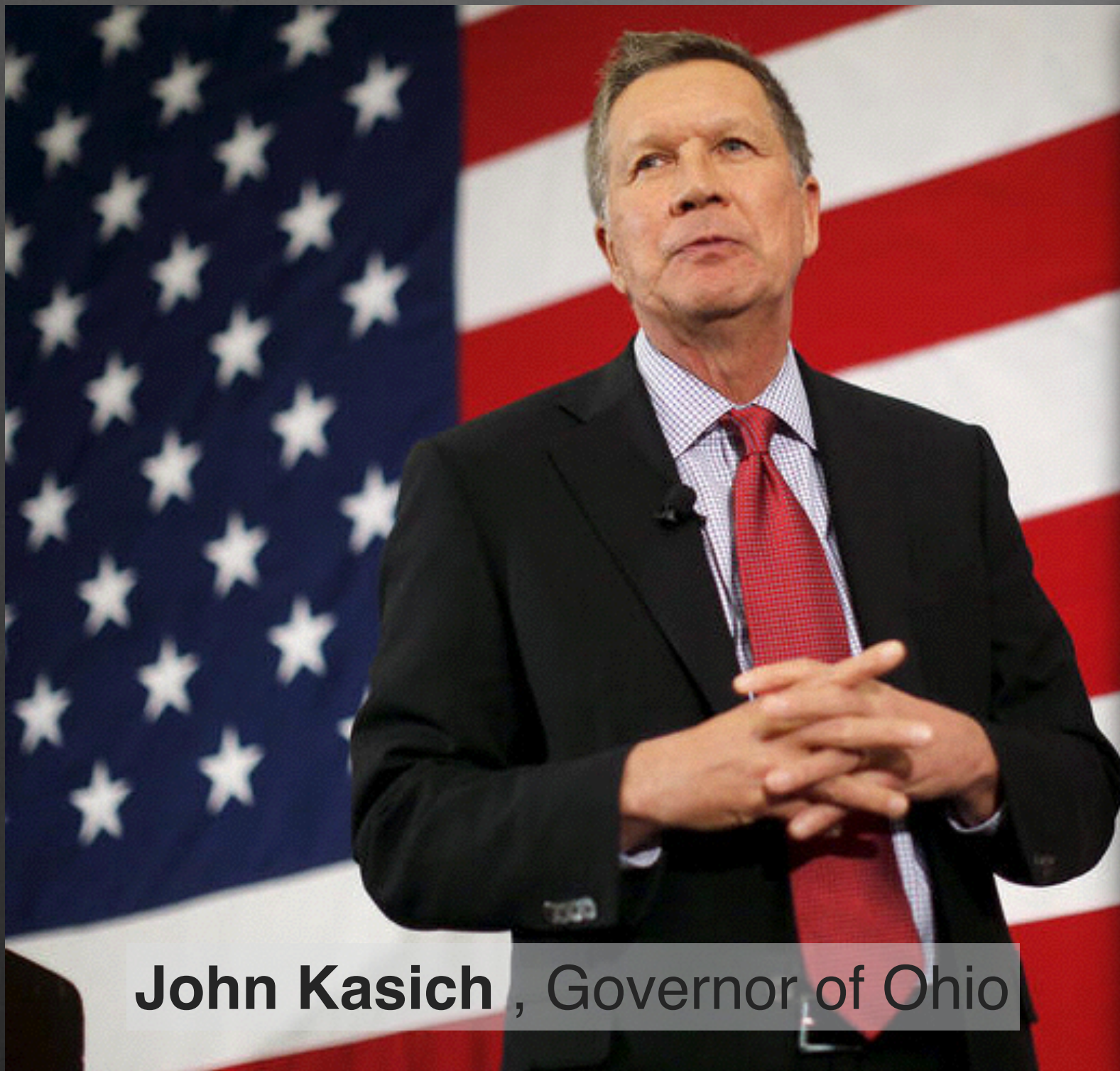
John Kasich , Governor of Ohio

“I have always said that the Lord has a purpose for me as he has for everyone. And as I suspend my campaign today, I have renewed faith, deeper faith, that the Lord will show me the way forward, and fulfill the purpose of my life.” Wed May 4, 2016