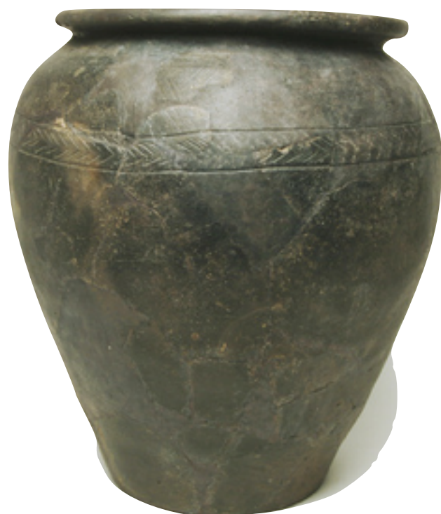
Illustration also applied to:

“Sculptors during the days of the Roman Empire, when making a mistake and causing a crack, fissure, or chip in the sculpture, would often fill the marred surface with wax, thus giving the impression of perfection. No one would notice the imperfection until sun shone on the statue, causing the wax to melt and run.”