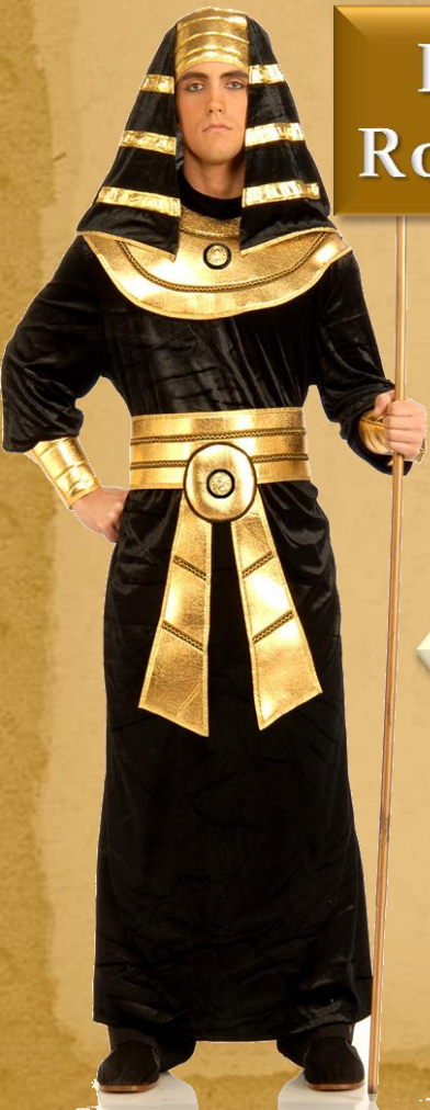
Pharaoh Rom 9:14-18