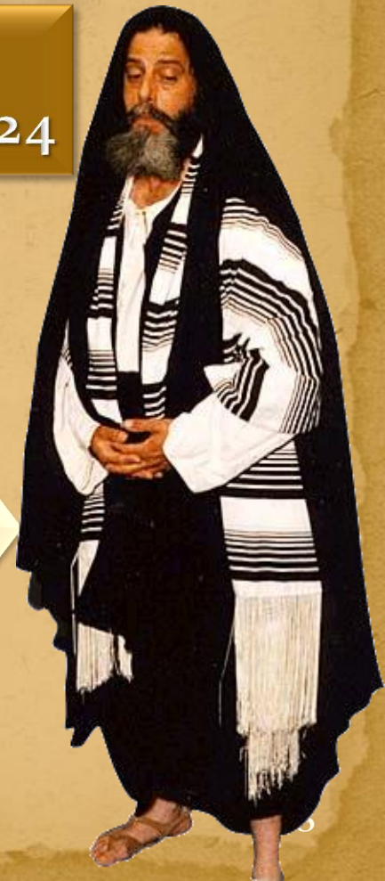
Israel Rom 9:19-24

God Raised Up Rejected God's word God Hardened through His word & mercy God's purpose was not thwarted by their rebellion